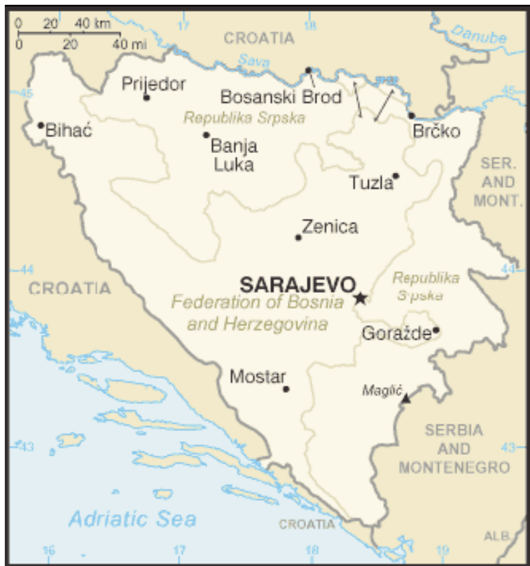
Figure 1 - Map of Bosnia & Herzegovina with the Federation and Republika Srpska entities.

organization of the country into the weak “two entity state” (figure one) has left many disenchanted with not only the US but the West in general. In addition, Bosniaks normally prize their close US relationship and for the most part reject the imported radical Islam, the influence of Islamic extremism cannot be discounted. Indeed, there have been efforts by the Bosniak dominated government to look outside the West for material and moral support to improve the economy and strengthen the central government. Alarming to the US, Bosnian officials have stepped up interaction with Iran, a known sponsor of terrorism, and other Islamic Gulf states.